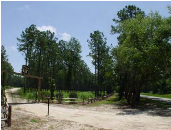
Fins & Feathers Entrance