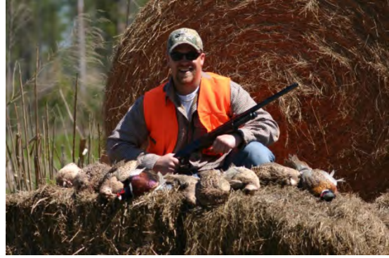
English Pheasant Shoot