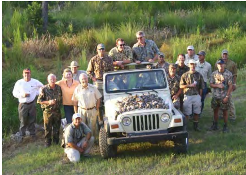
Fins & Feathers Dove Hunt