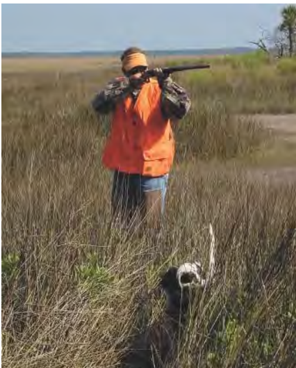
Quail Hunting along the Marsh