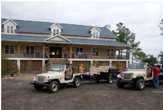
Ready for an Afternoon Quail Hunt