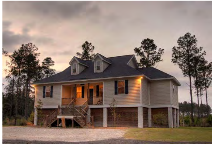
Covey Rise Cabin

The guest cabins were recently constructed in 2004 and make excellent guest houses for the Ownership group for entertaining clients or friends and family if the Plantation is sold to one individual owner or corporation. Each cabin can comfortably accommodate up to six guests. Purchasers of individual ownership interests will have fee simple ownership to one of the three cabins for their exclusive use and enjoyment.