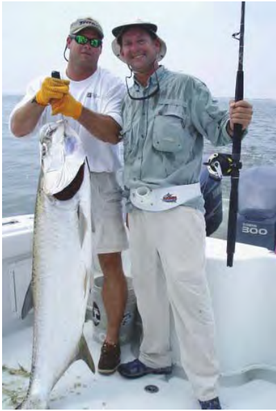
Sapelo Sound Tarpon