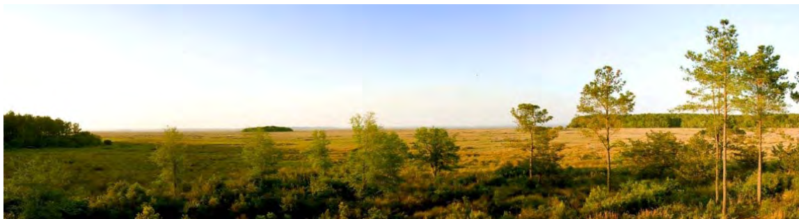
View from the Lodge at Fins & Feathers