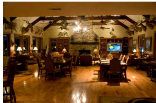
Dining Area & Game Room