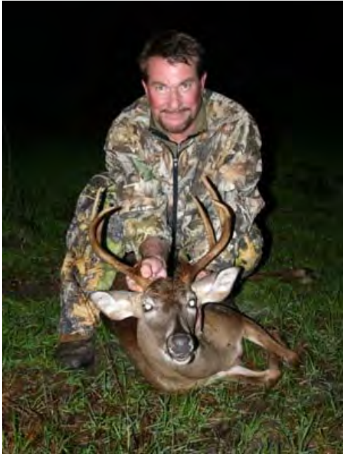
Fins & Feathers 8-Point Buck