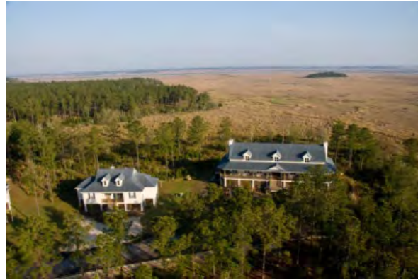
Lodge and Cabins