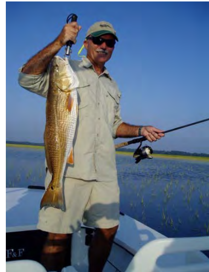
Sapelo Sound Redfish on the Flats