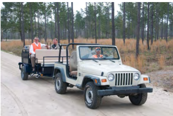
F&F Jeep and Custom Quail Wagon