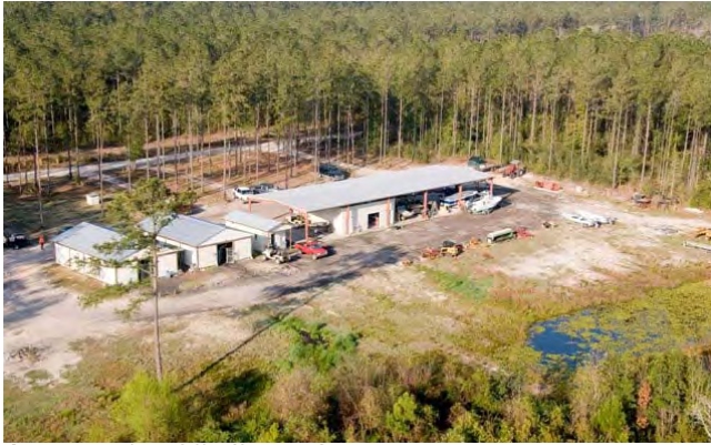
Aerial View of the Office/Storage Complex

The “Operations Center” for Fins & Feathers is a meticulously maintained assortment of buildings designed to make the operation and maintenance of the Plantation a streamlined process with immediate access to all equipment and tools. Fins & Feathers is offered for sale with all equipment necessary to operate the plantation included in the sale.