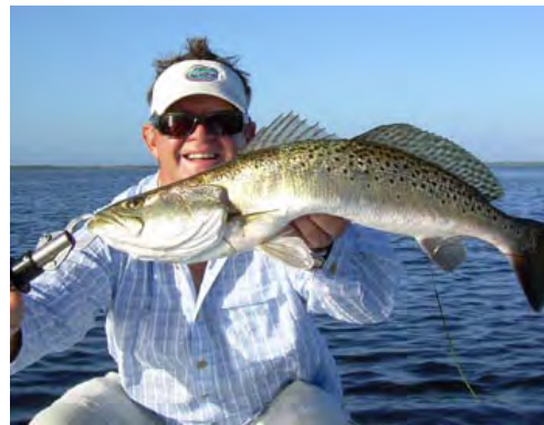
Sapelo Sound Sea Trout