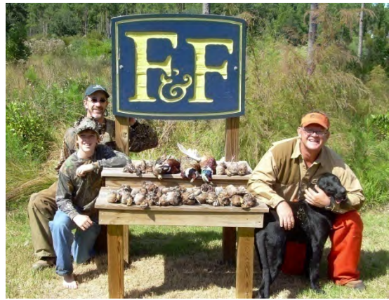
Successful Quail & Pheasant Hunt